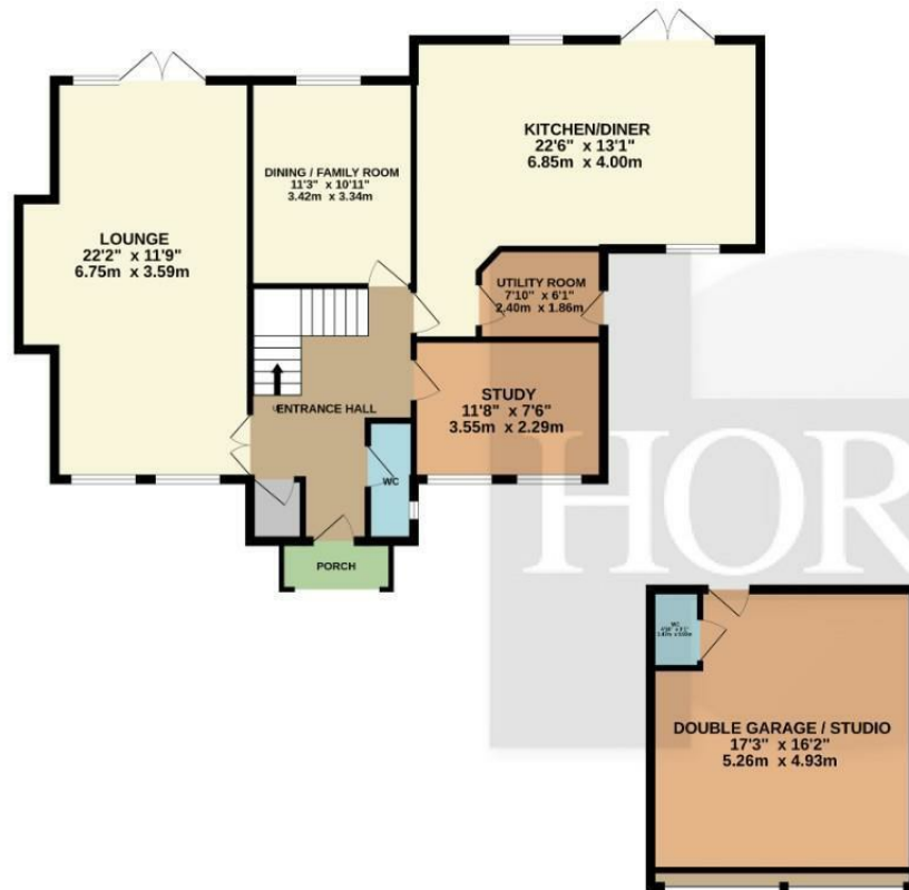
GROUND FLOOR 1337 sq.ft. (124.2 sq.m.) approx.