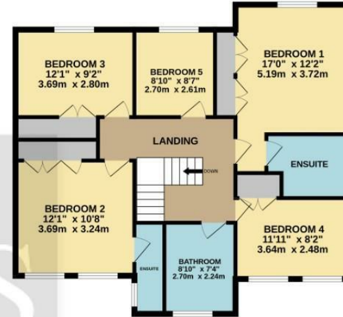
1ST FLOOR 896 sq.ft. (83.2 sq.m.) approx.